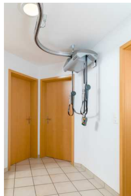
Lift in the parking position